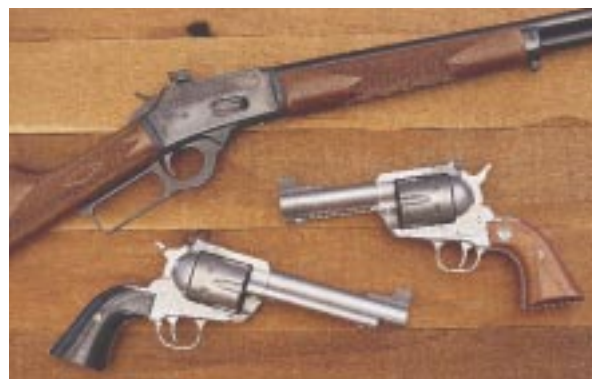
38 Shooters who appreciate fine sixguns and hard-working leverguns will enjoy the works of Clements Custom Guns.