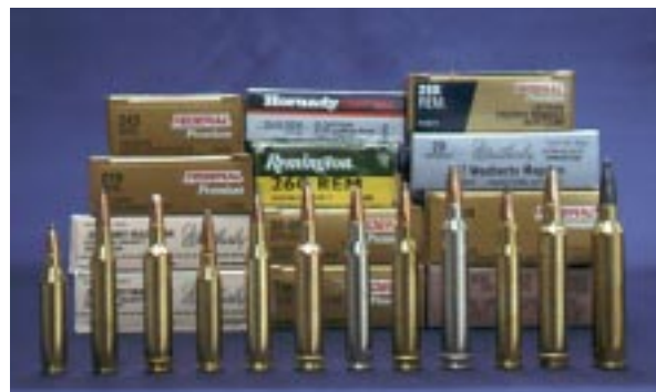
34 Hunters have a lot of ideas about bullet performance — and a lot of them are wrong. Choose your bullet based on ballistic facts.