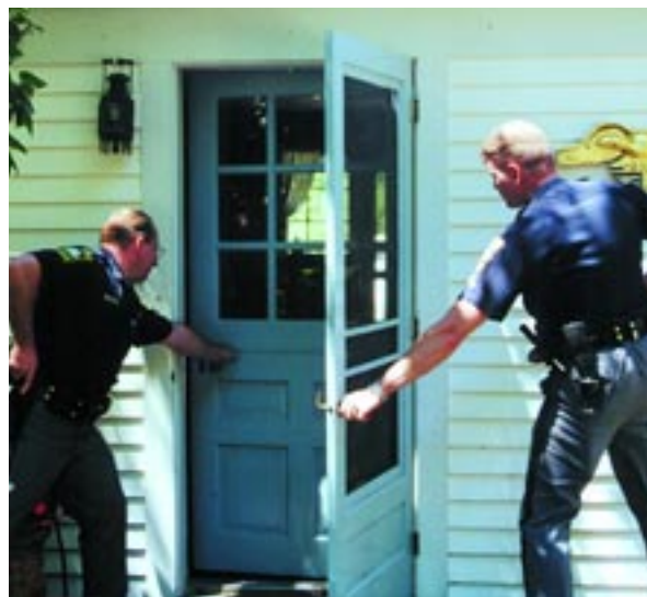
48 From good, solid locks to high-tech surveillance devices and effective emergency plans, there is more to home security than just owning a gun.

70 Heckler & Koch USC .45 BY CHARLES E. PETTY This carbine combines German design with the proven power of the good ol' American .45 ACP.