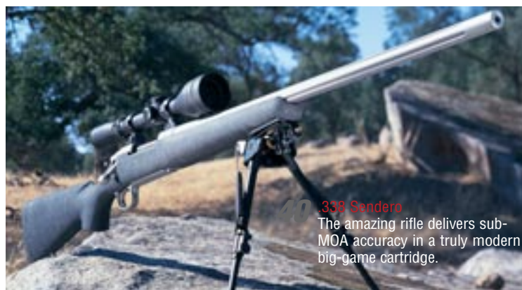
40 338 Sendero The amazing rifle delivers sub-MOA accuracy in a truly modern big-game cartridge.