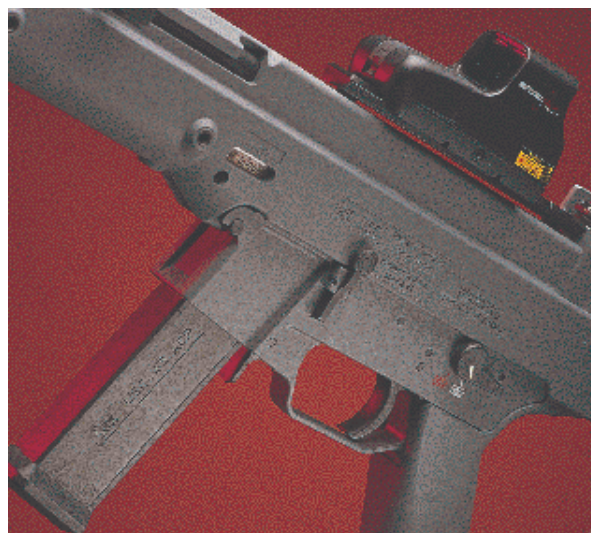
70 The HK USP .45 is a high-tech new carbine perfect for tactical law-enforcement use or home defense and family protection.